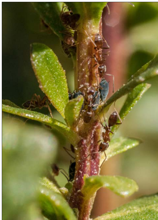
Fig. 1: The Argentine ant, Linepithema humile .

The association of Argentine ants and human habitation is common in its exotic range (e.g., WARD 1987, CARPINTERO & al. 2003). The distance that Argentine ants can spread into undisturbed areas from human development probably varies with climatic and environmental conditions. Water availability limits Argentine ants in natural areas