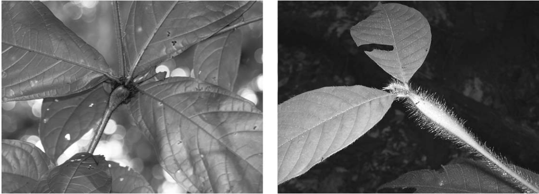
PLATE 1. Cordia nodosa (left) and Duroia hirsuta (right) branches, showing the stem swellings (domatia) that house ants.