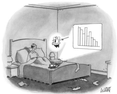
The Night Before the Big Meeting Frank Receives a Visit from the PowerPoint Fairy.