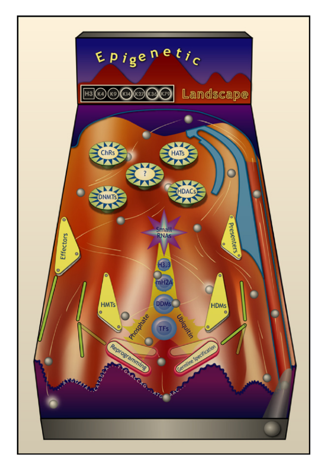
Figure 2. A Current View of the Epigenetic Molecular Machinery

(Heard, 2005). Moreover, DNMTs act in part by interacting directly or indirectly with chromatin-modifying enzymes such as histone deacetylases (Dobosy and Selker, 2001). New studies reveal that DNMT3L, an essential accessory protein to the de novo DNMTs in the germline, interprets patterns of histone modifications, adding weight to an emerging theme that DNA methylation and histone modifications functionally interact (Freitag and Selker, 2005; T.H. Bestor, personal communication).