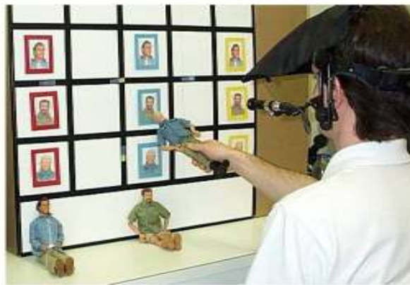
Figure 1. Runner et al. (to appear) display.

The availability of a coreferential interpretation under ellipsis in examples like (18) and (17b) provides our first argument against treating the possessor as part of the ARG-ST of the picture noun.