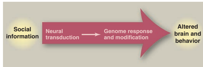
Fig. 2. Vector 1: From social information to changes in brain function and behavior. Social information is perceived by sensory systems and transduced into responses in the brain. Social information leads to developmental influences often mediated by parental care, as well as acute changes in gene expression that cause diverse effects (e.g., changes in metabolic states, synaptic connections, and transcriptional networks). Social information also can cause epigenetic modifications in the genome. Variation in both environment ( V_E ) and genotype ( V_G ) influences how social information is received and transduced and how these factors themselves interact ( V_E \times V_G ).

Social signals can also trigger long-lasting epigenetic modifications of the genome. These are heritable changes in expression of specific genes that are not attributable to changes in DNA sequence (Fig. 2). This phenomenon was first dis-