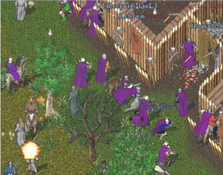
A clan attacks a home or fort in Ultima Online

for one's actions that society relies on, it is easy to see how an online community could degenerate into merely a group of self-serving individuals.