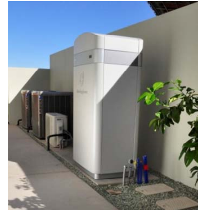
CE5 Beta Installation