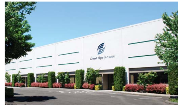
RD&M Center, Hillsboro, OR