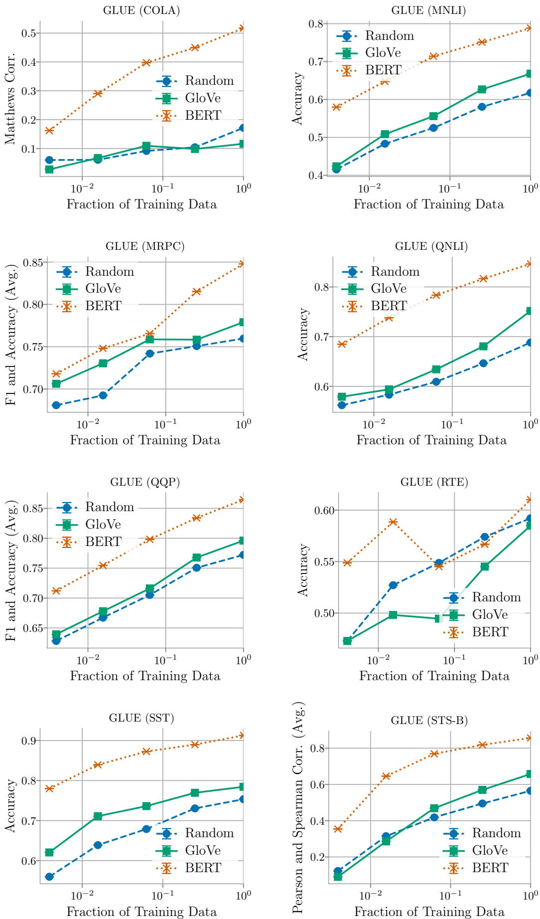
Figure 3: Performance of random, GloVe, and BERT embeddings on GLUE tasks as we vary the amount of training data