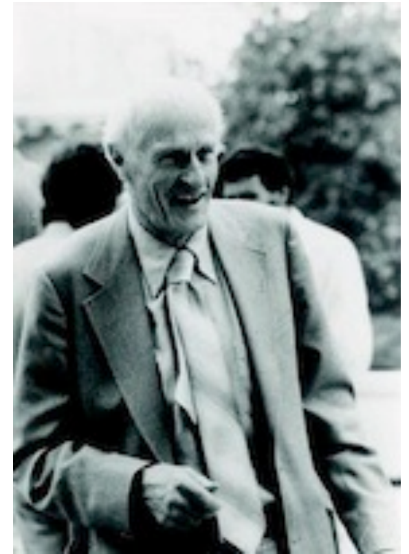
Stephen C Kleene