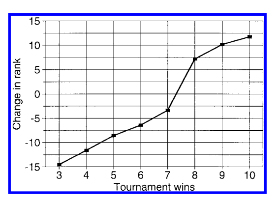
FIGURE 1. PAYOFF TO TOURNAMENT WINS

Figure 1 demonstrates empirically the importance of an eighth win to a wrestler. The horizontal axis of the figure is the number of wins a wrestler achieves in a tournament; the vertical axis is the average change in rank as a consequence of the tournament. The change in rank is a positive function of the number of wins. With the exception of the eighth win, the relationship is nearly linear: each additional victory is worth approximately three spots in the rankings. The critical eighth win—which results in a substantial promotion in rank rather than a demotion—garners a wrestler approximately 11 spots in the ranking, or roughly four times the value of the