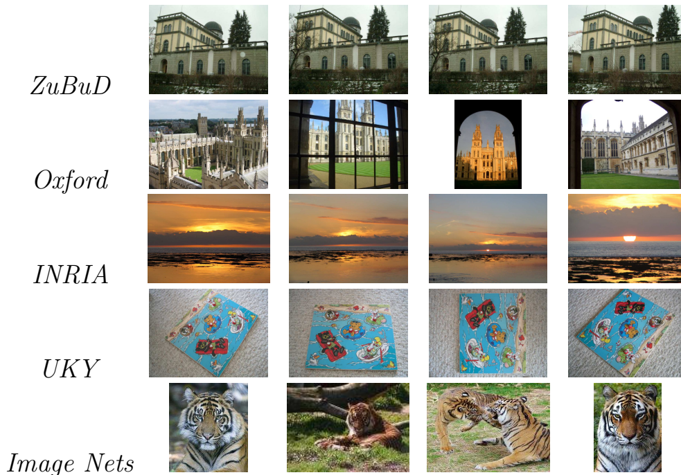
Figure 2: Limitations with popular data sets in computer vision. The left most image in each row is the database image, and the other 3 images are query images. ZuBuD, INRIA and UKY consist of images taken at the same time and location. ImageNets is not suitable for image retrieval applications. The Oxford dataset has different faades of the same building labelled with the same name.

Fig. 2 illustrates some images for the word “tiger”. Such a data set is useful for testing classification algorithms, but not so much for testing retrieval algorithms.