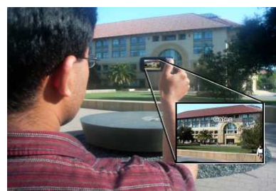
Figure 1: A snapshot of an outdoor visual search application. The system augments the viewfinder with information about the objects it recognizes in the camera phone image.

MMSys'11, February 23–25, 2011, San Jose, California, USA. Copyright 2011 ACM 978-1-4503-0517-4/11/02 ...$10.00.