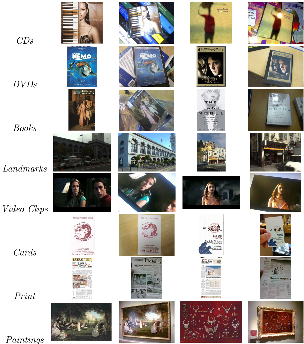
Figure 4: Stanford Mobile Visual Search (SMVS) data set. The data set consists of images for many different categories captured with a variety of camera-phones, and under widely varying lighting conditions. Database and query images alternate in each category.