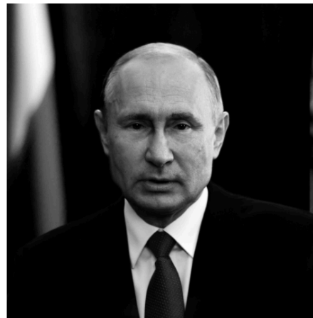
President Vladimir Putin's denials about the poisoning of a Russian politician aren't credible.