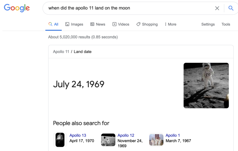
Figure 1: Google’s question answering system is able to answer arbitrary questions and is an extremely useful tool for serving information needs

example, the system would have 100% precision (its answer is a subset of the ground truth answer) and 50% recall (it only included one out of the two words in the ground truth output), thus a F1 score of 2 \times \text{prediction} \times \text{recall} / (\text{precision} + \text{recall}) = 2 * 50 * 100 / (100 + 50) = 66.67\% .