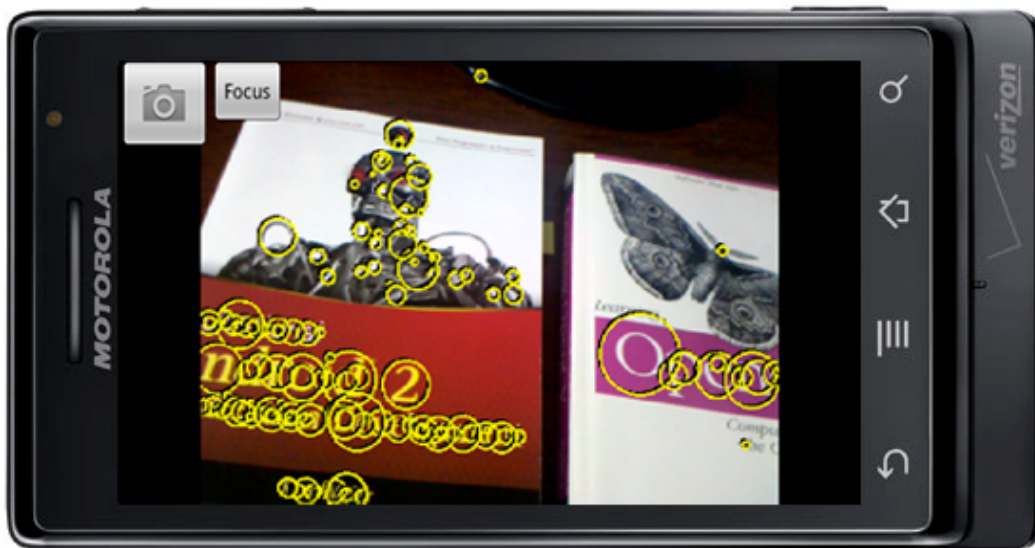
Figure 1. Android application drawing MSER feature keypoints on a viewfinder frame.

In this tutorial, we will learn how to install OpenCV for Android on your computer and how to build Android applications using OpenCV functions. The tutorial is split into two parts. In the first part, we will explain how to download and install the OpenCV library onto your computer. Then, in the second part, we will explain how to build an application that draws different types of feature keypoints directly in the video viewfinder of the Android device, as shown in Figure 1.