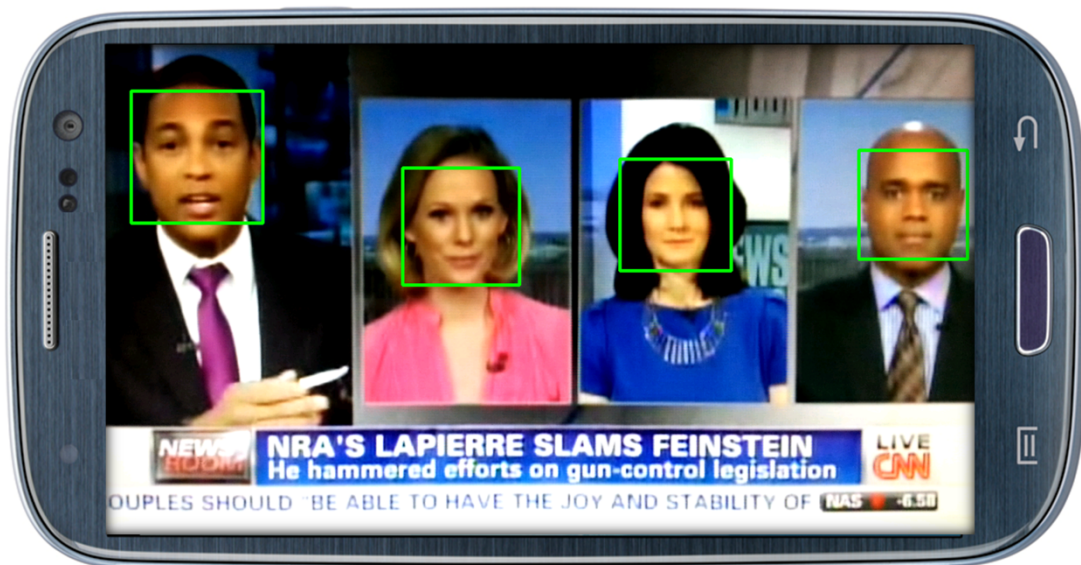
Figure 1. Android application drawing face detections on a viewfinder frame.

In this tutorial, we will learn how to install OpenCV for Android on your computer and how to build Android applications using OpenCV functions. First, we will explain how to download and install the OpenCV library onto your computer. Second, we will explain how to build applications that directly call OpenCV functions on the viewfinder frames of the Android device, as shown in Figure 1.