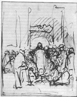
Figure 0.1 Rembrandt sketch

Pragmatics is the study of the ways we enrich the conventionalized meanings of the things we say and hear into their fuller intended meanings. In class, we'll focus on the principles that govern this enrichment process, with special emphasis on the extent to which it is systematic and universal.