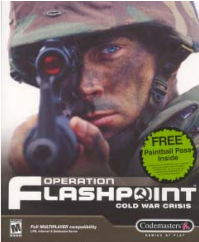
Operation Flashpoint (Bohemia Interactive and Codemasters, 2001).

distributed collaboration in a military context has come to signify “terrorist cells,” the potential mods based on the Unreal engine conjure up an all too frightening potential reality . No doubt somewhere, either in the game industry itself or among the worldwide community of mod builders, a group is currently developing a cyberterrorist game based on attacking the computer infrastructure of a country, disabling its power grid, infiltrating its financial networks, and hacking into mainstream news media such as the New York Times to confuse the public about what's going on. Will this be a market in which the U.S. military can choose (or afford) not to compete?