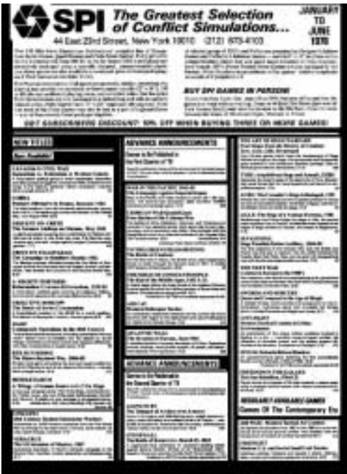
“SPI: The Greatest Selection of Conflict Simulations,” Advertising flyer, 1978.