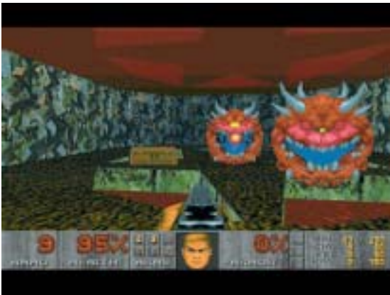
The Ultimate DOOM: Thy Flesh Consumed (id Software, 1995)

were a group of programmers led by John Romero and John Carmack, who had started as designers of games distributed with Softdisk magazine. Based on the success of games such as the Commander Keen series, they formed id Software in February 1991. From the beginning, id focused on the development of superior graphics technology. Carmack had demonstrated that personal computers could produce smoothly scrolling graphics to rival video consoles by writing a version for the PC of Nintendo's Super Mario Bros. 3 . At id, Carmack turned his attention to 3-dimensional graphics, writing the graphics engine for id's Wolfenstein 3-D , an action game published by Apogee. It depicted the action as the player's character would see it, setting the stage for DOOM as the next evolution of this game genre, the "first-person shooter." DOOM added numerous technical and design improvements: a superior graphics engine, fast peer-to-peer networking for multiplayer gaming, a modular design that let authors outside id create new levels, and a new mode of competitive play devised by Romero called "death match." DOOM was a phenomenal success, immediately establishing competitive multiplayer gaming as a leading genre of PC games.