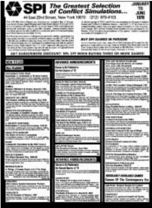
“SPI: The Greatest Selection of Conflict Simulations,” Advertising flyer, 1978.