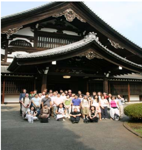
Field Trip: Sojiji Temple

Columbia University, Georgia Institute of Technology, Harvard University, MIT, New York University, Ohio State University, Pomona College, Princeton University, Stanford University, University of California Berkeley, University of California Los Angeles, University of California Santa Barbara, University of California Santa Cruz, University of Chicago, University of Hawaii, University of Illinois, University of Maryland, University of Pennsylvania, University of Southern California, University of Washington, University of Wisconsin