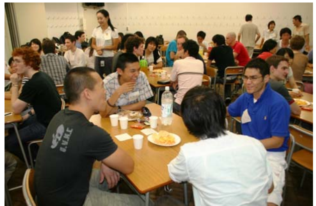
Visiting with students at Keio University