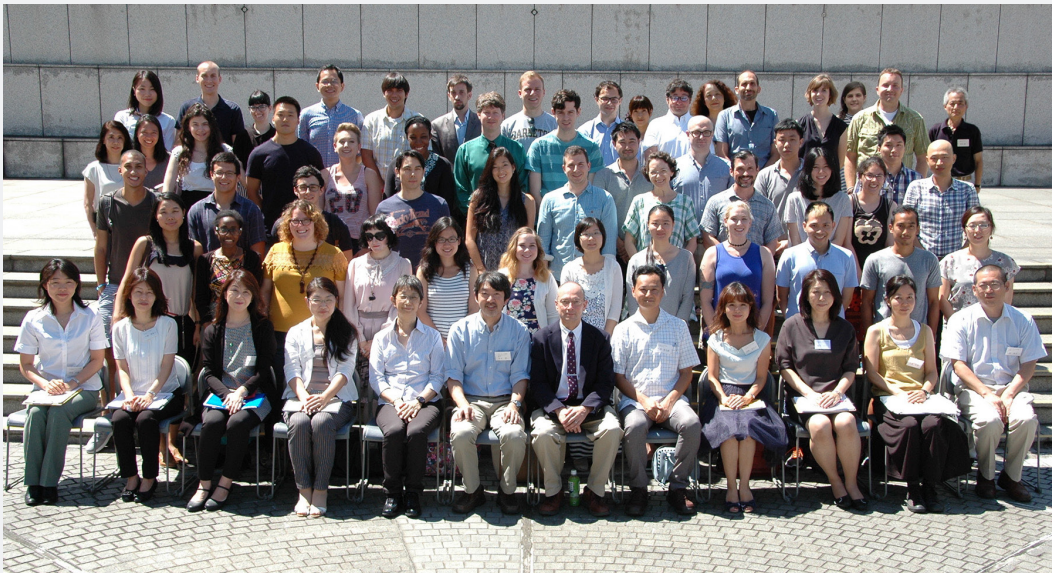
Class of 2016-2017