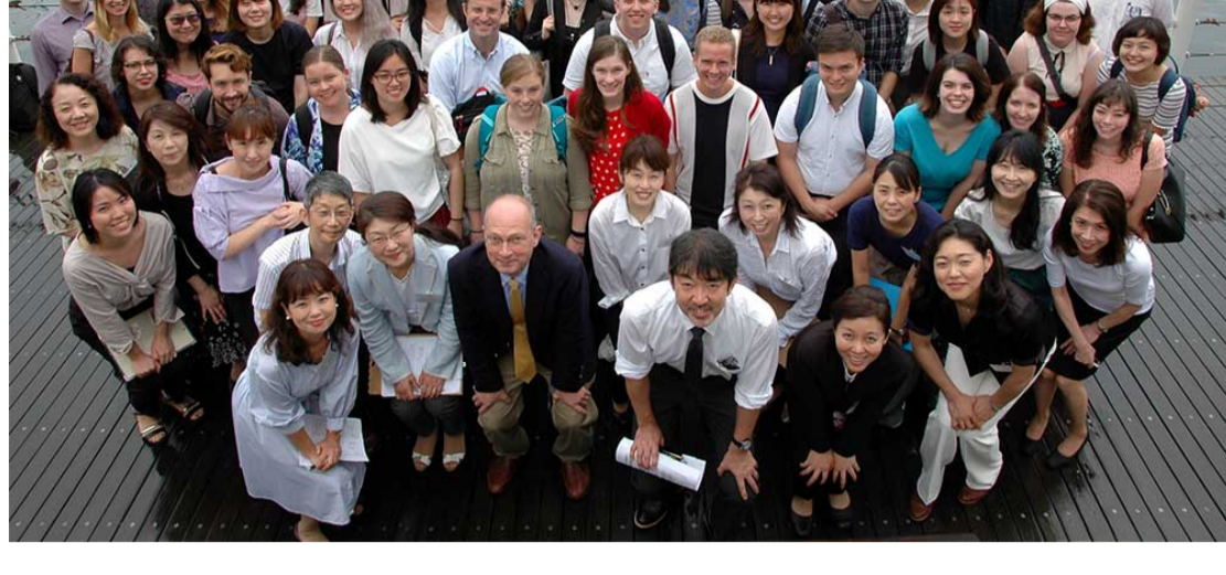
CLASS OF 2018-19

In September we welcomed a new class of 56 students, somewhat fewer than last year but still far larger than average. Here the class of 2018-19 poses by Pukari Pier on the waterfront behind the center. Thanks to the generous donations from our alumni company, we were able to provide financial support to eleven students who otherwise would not have been able to participate in our program. Thank you!