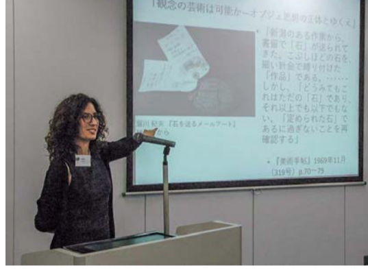
CLASS OF 2017-18

The class of 2017-18 was the largest in the IUC's history. Sixty-three students successfully completed the program – so many that the annual graduation presentations were spread out over three days (June 4, 5, and 6) rather than the customary two. Everyone did a great job and we are extremely proud of you! Please keep in touch!