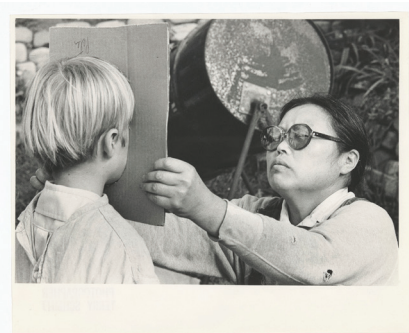
Facsimile of photograph depicting Ruth Asawa casting the faces of Alvarado Elementary School students and artists. Photographed by Terry Schmitt (1976), 2025. Inkjet prints. Courtesy of Department of Special Collections, Stanford Libraries