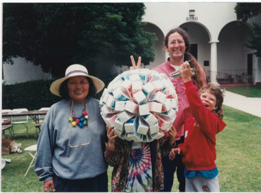
Facsimile of photograph depicting Ruth Asawa with two children and their parent holding a milk carton globe. Photographed by Ruth Souza (1995), 2025. Inkjet pigment print. Courtesy of Department of Special Collections, Stanford Libraries