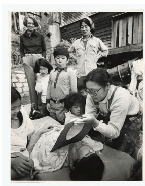
Facsimile of photograph depicting Ruth Asawa casting the faces of Alvarado Elementary School students and artists. Photographed by Terry Schmitt (1976), 2025. Inkjet prints. Courtesy of Department of Special Collections, Stanford Libraries