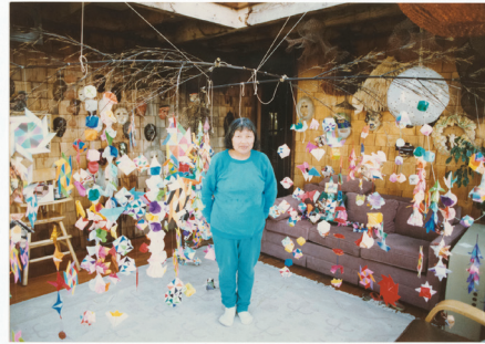
Facsimile of photograph depicting Ruth Asawa in her home surrounded by an armature of hanging origami, 1996. Inkjet pigment print. Artwork © 2025 Ruth Asawa Lanier, Inc., Courtesy David Zwirner. Courtesy of Department of Special Collections, Stanford Libraries