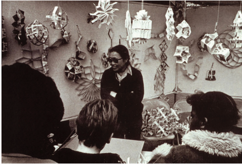
Ruth Asawa teaching geometric patterns with milk cartons, c. 1981. Artwork © 2025 Ruth Asawa Lanier, Inc., Courtesy David Zwirner. Courtesy Ruth Asawa Lanier, Inc.

These images are provided for the working media to use in publicizing the exhibition. All other uses are prohibited. Image may not be cropped or bled off the page, and nothing may be superimposed on any image.