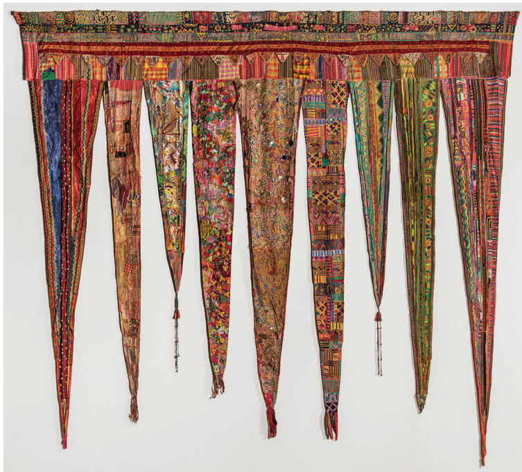
Pacita Abad (Philippine-American, born in the Philippines, 1946 – died in Singapore, 2004), 100 Years of Freedom: From Batanes to Jolo, 1998. Cantor Arts Center, Stanford University, Patricia Geary Johnson Asian Art Acquisitions Fund, 2023.178.