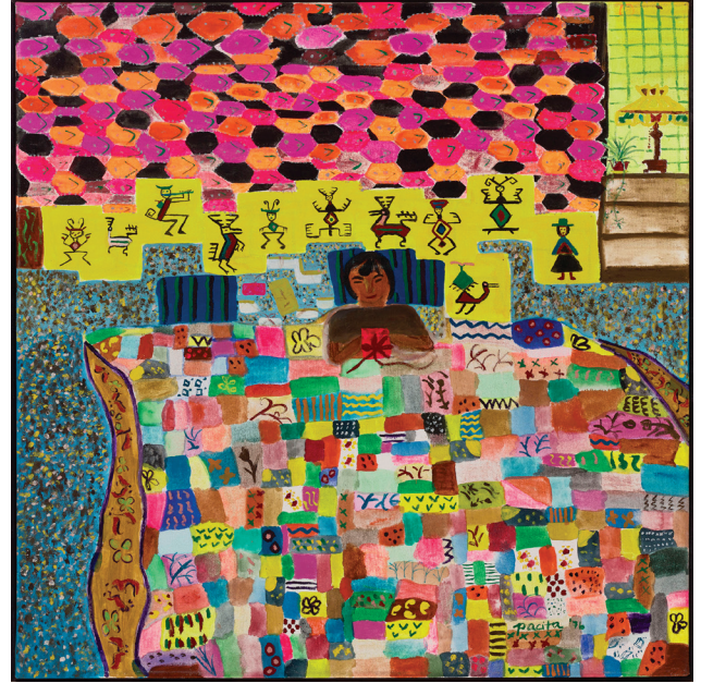
Pacita Abad (American, born in the Philippines, 1946–2004), Foothill Cabin, 1976. Oil on canvas. Cantor Arts Center, Stanford University. Patricia Geary Johnson Asian Art Acquisitions Fund, 2023.175.