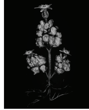
Miljohn Ruperto and Ulrik Heltoft, Voynich Botanical Studies, Specimen 23v Leto , 2017, from the series Voynich Botanical Studies , 2012–ongoing. Gelatin silver print on fiber-based paper.