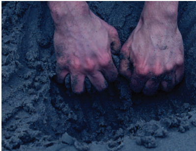
Miljohn Ruperto, Everything is Shore , detail from Seven and Five , 2012. 7 channel video installation (7 CRT monitors on pedestals, 5 oil paintings) (color, sound), 21:30 min.