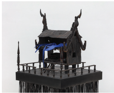
Korakrit Arunanondchai (b. 1986, Bangkok, Thailand; lives and works in Bangkok and Brooklyn, NY), Shore of Security , 2022. Repurposed wooden doll house made by the artist's mother, wood, house paint, polyurethane, fabric sculpture, ceramics, snake skeleton, LED lights. Courtesy of the artist and CLEARING, New York / Brussels / Los Angeles. Photo: JSP Art Photography