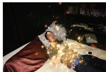
Apichatpong Weerasethakul (b. 1970, Khon Kaen, Thailand; lives and works in Chiang Mai, Thailand). The Vapor of Melancholy , 2014. Lightjet print on Duratrans, lightbox. Courtesy of the artist and kurimanzutto Mexico City / New York. Image courtesy of the artist and kurimanzutto Mexico City / New York