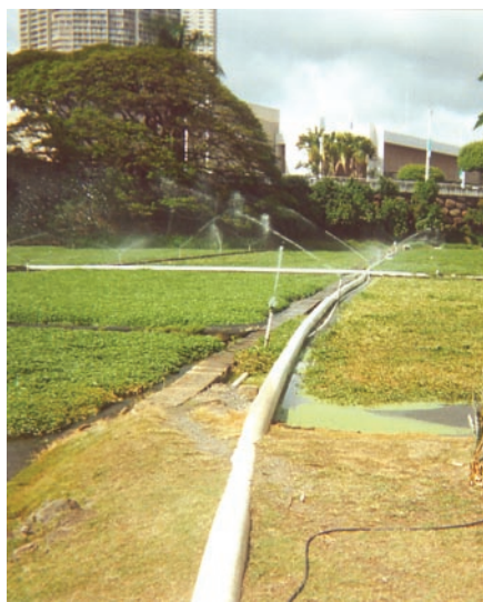
Fig. 1. In this field of water cress, the world’s biggest selling biopesticide, Bacillus thuringiensis (Bt) toxin, was overcome by the evolution of resistance in diamondback moths. This pesticide is engineered into millions of acres of crop plants, and so the ability of insects to evolve resistance has created anxiety in the biotechnology industry.