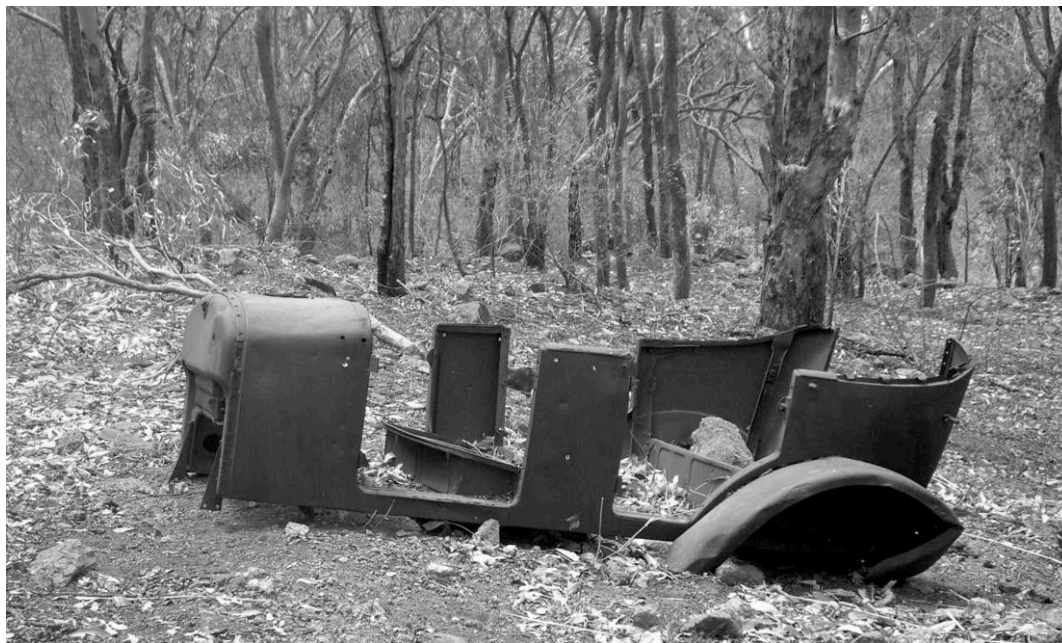
Figure 2. A Ford abandoned in the Italian military camp at Mankush (Ethiopia) by Mussolini's troops.