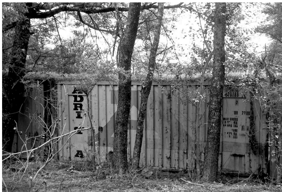
Figure 11. Containers from an abandoned development project in Benishangul-Gumuz (Ethiopia).

invisible bombers, and the missing bodies of political opponents. Archaeologists have to make things visible and public (Ludlow Collective 2001; Leone 2005; González-Ruibal 2007).