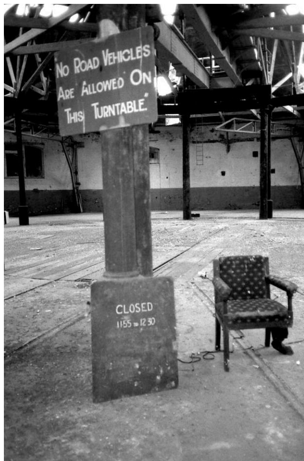
Figure 1. Industrial ruin.