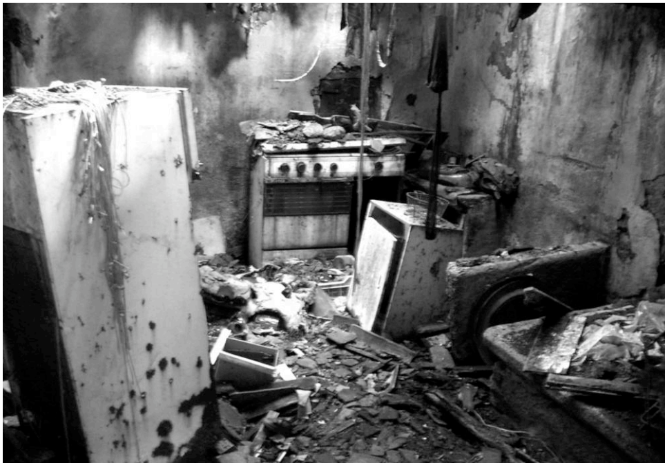
Figure 6. The interior of a house abandoned in Galicia (Spain) by emigrated peasants.