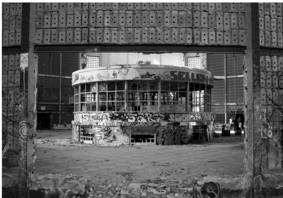
Figure 12. The panopticon of Carabanchel prison as seen from a gallery today.

is a place of abjection, but it is also a site of deep sociality—hardly a non-place.