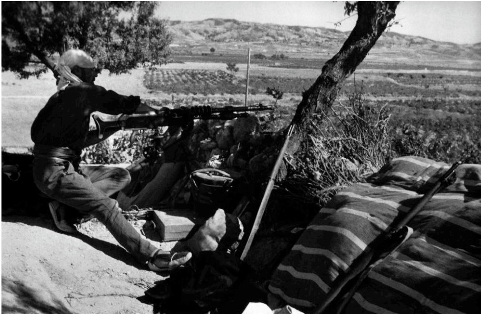
Figure 5. A Spanish peasant, in traditional attire, using a machine-gun in 1936.