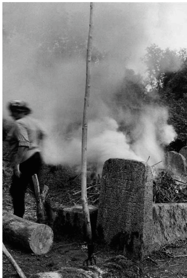
Figure 3. A Jewish cemetery, Berdichev (Ukraine).

caveat in mind, I am not proposing here that archaeology be turned into art, thus replicating the move of the archaeologists turned writers. As archaeologists, we have our own rhetoric, a Heideggerian way of manifesting Being, between the world and the earth. We work between revelation—how this truck exploded when driven over a landmine (González-Ruibal 2006, 186)—and concealment—why this house was abandoned (Buchli and Lucas 2001c). We are trained to read material traces and engage in meaningful and original ways with the qualities and textures of things; we know about material culture and history, and we have developed a methodology for documenting and interpreting the past. This methodology is so powerful that some artists are basing their work on it (most famously Mark Dion [see Renfrew 2003]), and writers such as Foucault and Freud constantly used archaeological tropes in their writings. Both artists and archaeologists are concerned with documentation, 1 but we archaeologists are specialists in it. Our mode of revealing truth includes a variety