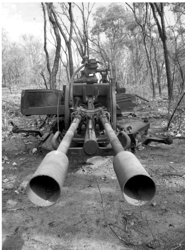
Figure 1. A Soviet anti-aircraft gun (ZSU-23) destroyed in an ambush during the Ethiopian civil war.

by the explosion, and the anti-aircraft gunner's seat, pierced by countless fragments. We have evidence that will not appear in the usual historical narrative but helps to create a strong sense of presence. At the same time, however, we can relate this micro-event to the global politics of the time, involving the cold war, development policies, nationalism, peasant societies, the history of ethnic and political conflict in the Horn of Africa, and modern technology. Suddenly, this is not just another tiny story but an event made globally significant. It all depends on how we tell it. Archaeology, then, can do more than produce alternative stories: it can also tell stories in an alternative way.