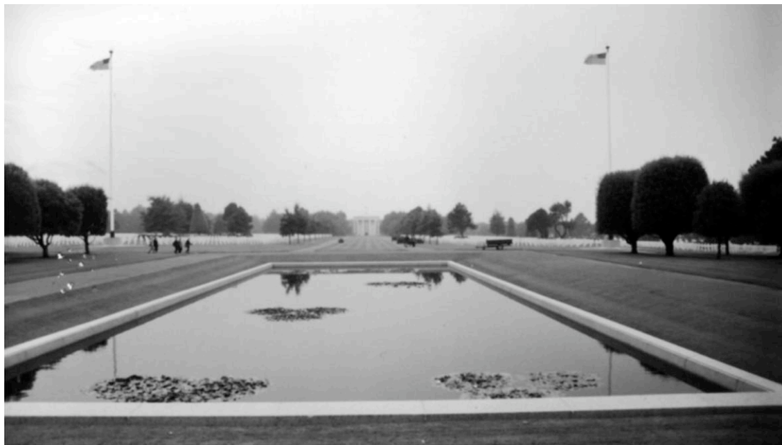
Figure 9. The American cemetery and memorial at Omaha Beach (Normandy).

but whether a locale should be remembered at all: consider the remnants of the Berlin Wall (Klausmeier and Schmidt 2004). Settlements with ruined vernacular architecture in Galicia are for many former peasants a dystopia about which they prefer not to talk. They are often isolated from new urban-style sprawls (fig. 10) and concealed behind façades of modernity—rows of modern brick-and-concrete houses along the roads (González-Ruibal 2005a). They convey a powerful message of poverty and underdevelopment for those who, until a few decades ago, depended on the plow for their survival. Nonetheless, they are also lieux de mémoire for many educated urban Galicians: the sturdy vernacular house is a symbol of national identity as much as the anthem and the flag ( lieux de mémoire in Nora's sense), and it has been constructed as an everlasting ethnographic element, a metaphor for "Galicianness," by local anthropologists (González-Ruibal 2005b, 140–42). These conflicting views on the archaeology of the recent past produce heterogeneous built environments, environments as heterogeneous as the narratives about that same past: thus, there are villages with some houses refurbished in pseudo-vintage style by urbanites and others, in ruins, whose former inhabitants have decided to build modern residences elsewhere. Dystopia and Utopia may coalesce in the same spot.