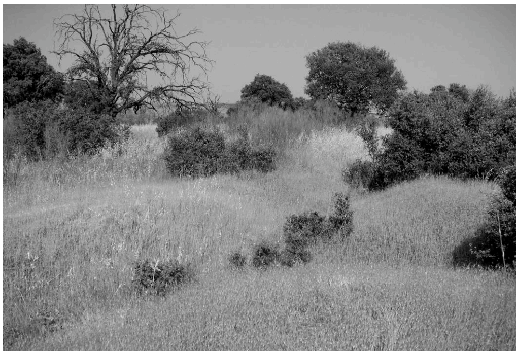
Figure 7. Overgrown trenches from the battle of Brunete (1937) near Madrid (Spain).

Most places are in constant ontological change. Their transformations depend on the materiality of the locale as much as on the social context, the historical circumstances, and the multifarious interests embedded in them. Places of abjection and mnemotopoi , as materializations of a nonabsent past that