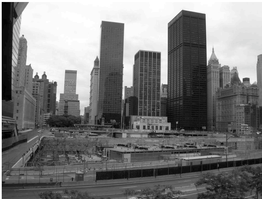
Figure 8. New York's Ground Zero.

cannot be controlled or subjected to a definitive interpretation, are more prone to sudden change (Domanska 2005, 405), but lieux de mémoire are also characterized by constant metamorphosis (Nora 1984, xxxv). As may be easily supposed, the role of archaeologists can be fundamental in changing the status of particular sites. The cold-war sites in the United Kingdom (Cocroft and Thomas 2003) are a good example of places of abjection that are being inventoried, classified, studied, and, therefore, ontologically transformed into mnemotopoi , soon to become lieux de mémoire . As Runia (2006a, 18) points out, the more a monument is interacted with, the more it loses its presence and becomes a platitude.