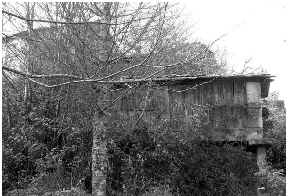
Figure 10. Ruined houses and granaries, concealed by overgrown vegetation, in Galicia (Spain).

trivial is even more threatening, but not many archaeologists seem to worry about this. It is not clear to me, for example, why we should document the over 500 remains of war planes from 1912 to 1945 that are known to exist in Britain (Holyoak 2002) or the 14,000 anti-invasion defenses in Britain from World War II (Schofield 2005, 57). Do we need 500 micro-histories about as many micro-events? What are the effects on collective memory of the preservation, restoration, and display of thousands of pillboxes? Although new ways of documentation and management are being developed (Schofield, Klausmeier, and Purbrick 2006) the risk of saturating and trivializing memory remains. Sites that are overdocumented and manicured lose their aura and their political potential. Against the deritualization of our world, which allows lieux de mémoire to deaden the past (Nora 1984, xxiv), archaeologists should return ritual to the landscape (e.g., Pearson and Shanks 2001, 142–46).