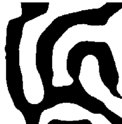
Fig. 2: Ocular dominance map. Cortical cells dominated by left and right eye input are shown in black and white respectively. Parameters: k_{LR} = 0.5 , \sigma_{in} = 2\sqrt{2} , \sigma_A = 1 , \sigma_G = \sqrt{5} , T_1 = 9562.37 , T_2 = 82.72 .

We simulated two 2D arrays of 20 by 20 LGN afferents terminating onto a 2D cortical plane sampled at a 200 by 200 array of points. As in the simulation of ocular dominance column formation, we initialized the axon locations with a noisy rectangular