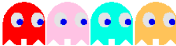
The bad guys: Blinky, Pinky, Inky, and Clyde

One of the features that balances out the difficulty of the game is “scatter mode.” Iwatani felt that if the ghosts constantly attacked Pac-Man, the game would be too stressful. So he created “scatter mode”, where every once in a while the ghosts would stop their pursuit of Pac-Man and head to a particular corner of the maze. At all other times the ghosts follow certain behaviors while trying to hunt down Pac-Man (Anonymous in Ghost Psychology ).