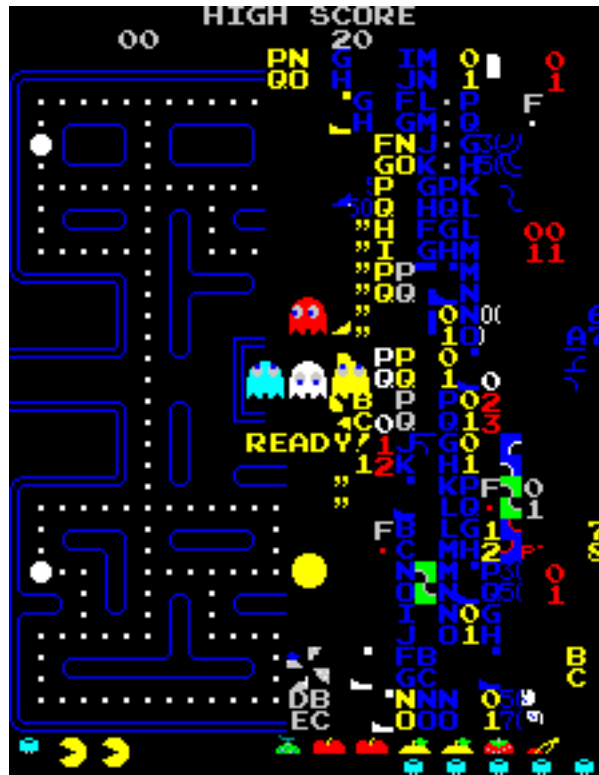
The unbeatable 256 th screen, screenshot from http://www.geocities.com/arcadeclassics.geo/PACMAN.html

(Sellers, 56). The only way to “win” at Pac-Man is to make it to the 256 th screen, where half the board becomes a digital mess and cannot be completed (Patterson). Other than this glitch in the game, Pac-Man is an unending battle between him and the ghosts. His appetite is never satisfied.