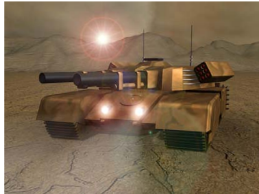
Figure 5: Cut scene

actors in full-motion video with the cut scenes between scenarios were very well received. “Between each mission is a superbly rendered cut sequence, featuring digitised actors and computer graphics the like of which I’ve not seen before on a game of this ilk. Simply breathtaking” (Chown). Furthermore, the cut scenes added to the overall experience by providing an otherwise impossible view into the game. “The cinematics in these games let players look at the world from other perspectives, offering images and information that these players can hold in their minds as they play the game. As we watch a unit’s health go into the red in C&C , we remember the opening scenes of missiles and bullets ripping through flesh and steel”