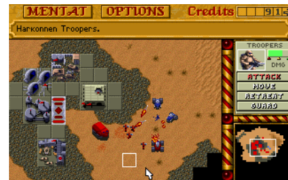
Figure 3: Similarities of Dune II (above) and C&C (below)

Top 100 game chart within two weeks of release (Chown). An examination of what C&C brought to RTS may provide insights.