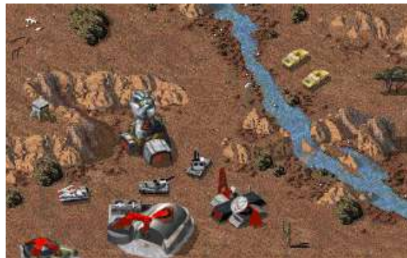
Figure 6: Low resolution video

Concerning game play, players became frustrated with the “fog of war”. In C&C,