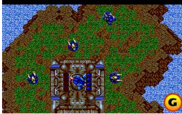
Figure 2: Herzog Zwei (1989)

things up and obliterate the turn-based drudgery” (Romaine). Still, the marriage of war games and computers needed time to develop. Nearly three years before Dune II hit shelves, RTS had its first real game in Herzog Zwei (1989) for the Sega Genesis. Although it contained a mere fraction of the complexity of some paper war games, it was pioneering in