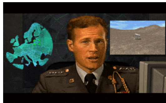
Figure 4: Digitized actor in cut scene

Virtually every review of the game highlighted the professional look and feel of the game and its attention to detail. Every aspect of the game was well presented from the install screen to the introductory video to the cut scenes. Particularly, the digitized