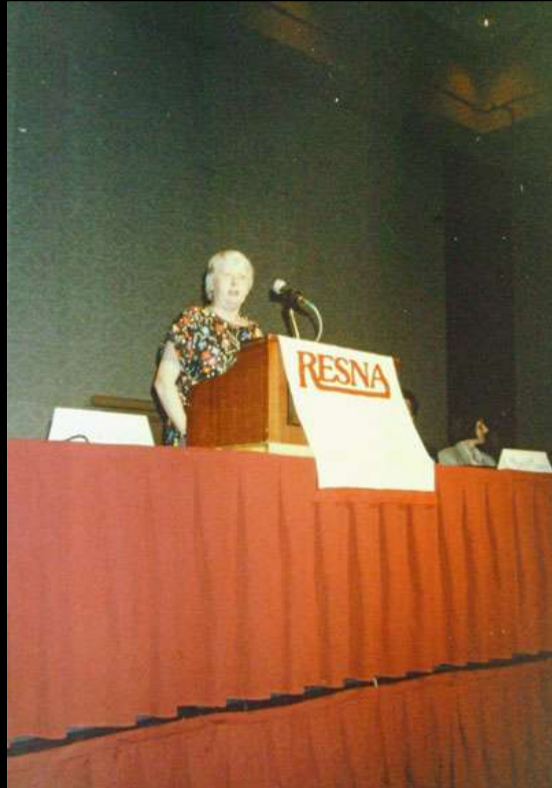
??? at the podium