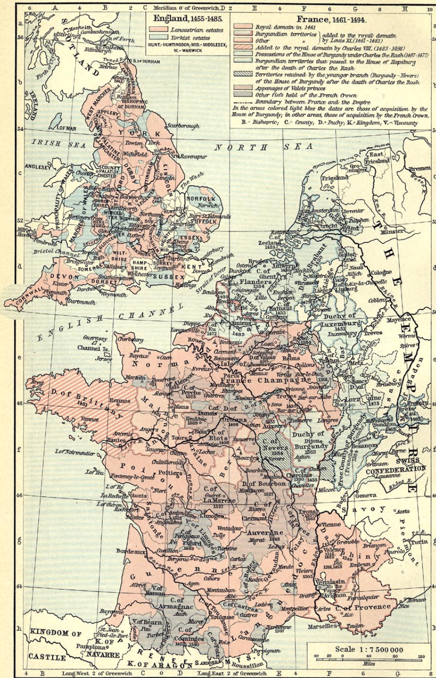
Figure 1: Map of England and France 1455-1494