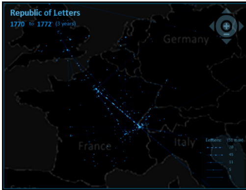
Figure 3: Flow view offers what historian Anthony Grafton imagined and described in print as “pulsating highways.”

Because neither the Connections nor Volume views illustrated directionality of letters between cities, we sought to design a view that would reveal this dimension of the network as well. Various static views we attempted failed to represent flow clearly because of visual clutter, so we elected to animate the view. In the view captured in Figure 3, dots travel between cities, with frequency and alpha used to encode volume, and direction of movement to encode directionality.