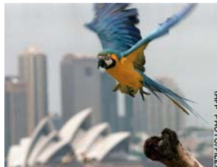
The gold macaw, just one of many endangered bird species.

They examined conservation efforts, bird distribution, their ecological functions and life histories.