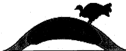
Figure 1. The Australian Megapode. Once thought to be descendants of reptiles, the megapode expresses the synapomorphic trait of using environmental heat sources to incubate their eggs.

Later on, some of the tropical forest mound-builders might have laid their eggs between the decaying roots of