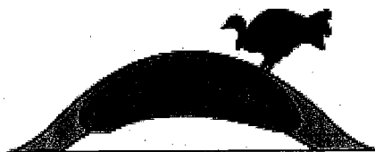
Figure 1. The Australian Megapode. Once thought to be descendants of reptiles, the megapode expresses the synapomorphic trait of using environmental heat sources to incubate their eggs.

Later on, some of the tropical forest mound-builders might have laid their eggs between the decaying roots of