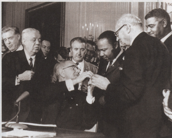
President Johnson presents Martin Luther King with one of 72 pens used to sign the Civil Rights Act of 1964.

King rushed to the scene of the riots. "As soon as we began to see our way clear in the South, the shock and horror of Northern riots exploded before our eyes, and we saw that the problems of the Negro go far beyond mere racial segregation," he