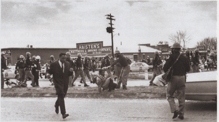
Civil Rights activist Hosea Williams tries to escape during “Bloody Sunday” on March 7, when Alabama state troopers attacked civil rights demonstrators.

“What happened in Selma is part of a far larger movement which reaches into every section and state of America. It is the effort of American Negroes to secure for themselves the full blessings of American life. Their cause must be our cause too. Because it is not just Negroes,