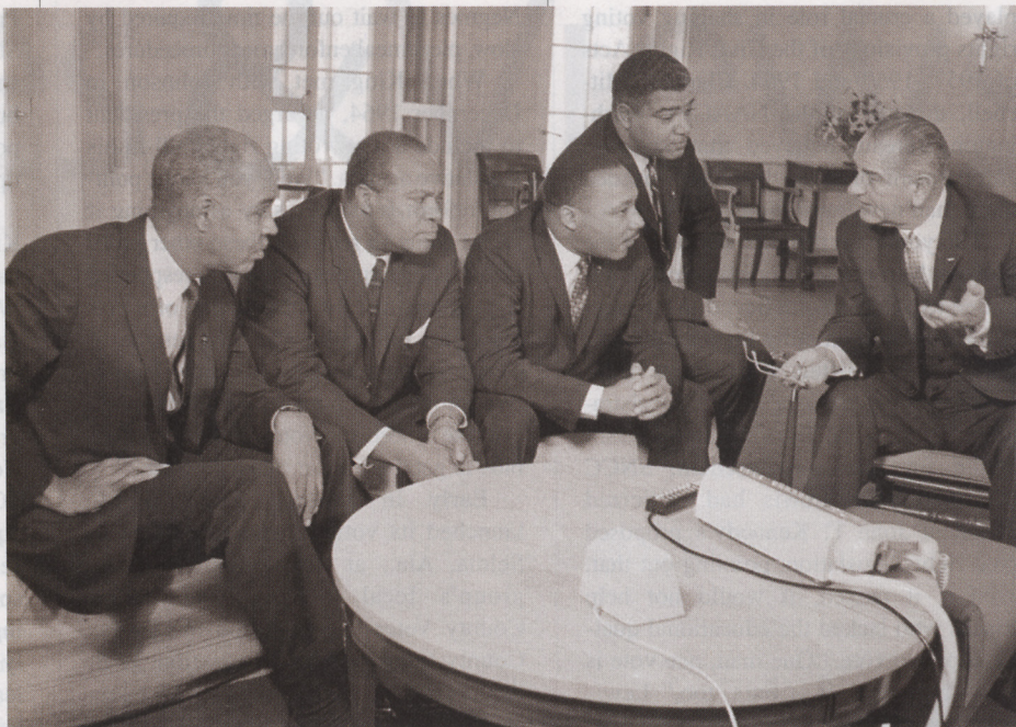
From left, leaders Roy Wilkins, James Farmer, Martin Luther King Jr. and Whitney Young with President Lyndon Johnson, who signed the Voting Rights Act in 1965.

When King delivered the eulogy at Jackson's funeral, he announced that the march would begin on March 7. He placed responsibility for Jackson's death not only on segregationists, but also on the complacency of some Black Americans, as well as "the timidity of a federal government that is willing to spend millions of dollars a day to defend freedom in Vietnam, but cannot protect the rights of its citizens at home."