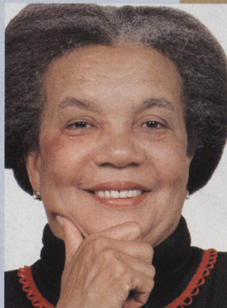
Marian Wright Edelman

As a man of intense intellectual interest, I imagine that my father would have loved the Internet as a living, breathing encyclopedia, updated every second. As a leader of nonviolent campaigns, he would surely recognize and use the