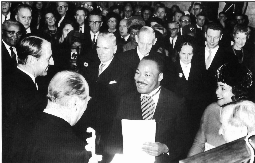
Dr. Martin Luther King, Jr., receiving the Nobel Peace Prize in Oslo, Norway, on December 11, 1964, with Coretta Scott King looking on. The thirty-five year old King was the youngest recipient of the award at the time.