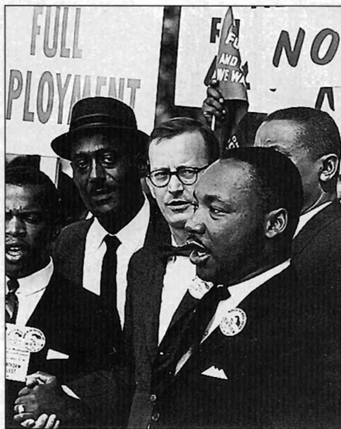
Dr. Martin Luther King, Jr., and other civil rights leaders at the March on Washington in the nation's capital, August 28, 1963. At the far left is John Lewis, chair of the Student Nonviolent Coordinating Committee, who gave a controversial speech at the event.