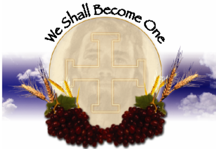
Men's Fall Cursillo—November 4th-7th, 2004

Location – Presentation Center Theme – “We Shall Become One” Song – As Grains of Wheat