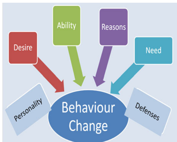
Fig. 7.1 Core skills of motivation to CBT for anxiety disorders (Adapted by Rollnick et al. 2008)

immediate, sizable, and probable, such as monetary reward for drug abstinence (Gaynor et al. 2006). For instance, the Kendall's Coping Cat program (Kendall and Hedtke 2006) developed to treat anxiety disorder in childhood include positive reward for each homework completed. Examples include collectable cards (e.g., Pokémon cards), stickers, and small prizes that can be purchased in bulk (Beidas et al. 2010). Unfortunately, the applicability of this positive reinforcement for adult is not well established. Another strategy is to provide psychoeducation on the importance of homework compliance to prevent relapses and the use of motivation strategies to enhance adherence. For example, the therapist might doubt whether the patient can sustain homework adherence in the absence of symptoms or provide a challengeable counterargument against continued adherence (e.g., "maybe you don't need additional practice such as homework"). These motivation strategies put the patient in the position of arguing for additional adherence, so it is the patients decision to do so (Gaynor et al. 2006).