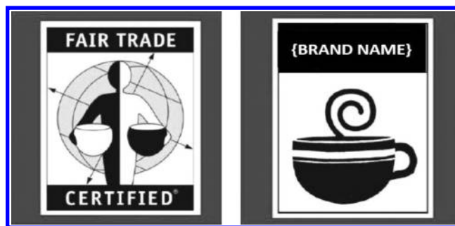
FIGURE 1.—TREATMENT AND CONTROL CONDITION FOR THE LABEL EXPERIMENT

9 The value of the Fair Trade label to firms and consumers will depend in part on the degree to which consumers regard the particular third-party certifier as trustworthy. It is worth noting that our tests were not designed to assess the importance of third-party certification per se or the trustworthiness of FLO in the eyes of consumers (relative to the trustworthiness of the grocery store partner).