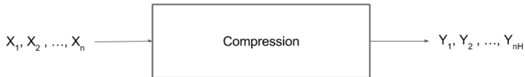
Figure 3.2: Data compression.

The proof uses weak law of large numbers and will be discussed in the next set of lecture notes.