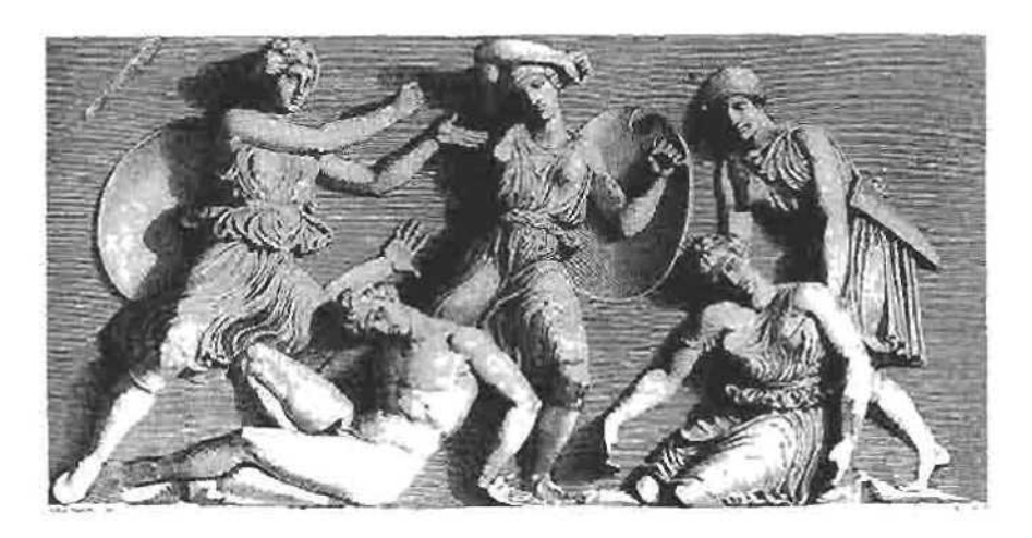
Figure 2.4 Baron von Stackelberg. Der Apollotempel zu Bassae in Arcadien [The Temple of Apollo at Bassae in Arcadia]. Rome and Frankfurt am Main 1826. Plate 9

While he had been lying grovelling on the earth we had never seen his face at all; so that, when we had set him on his base, and our eyes met for the first time his calm, majestic gaze, it seemed as if we had suddenly