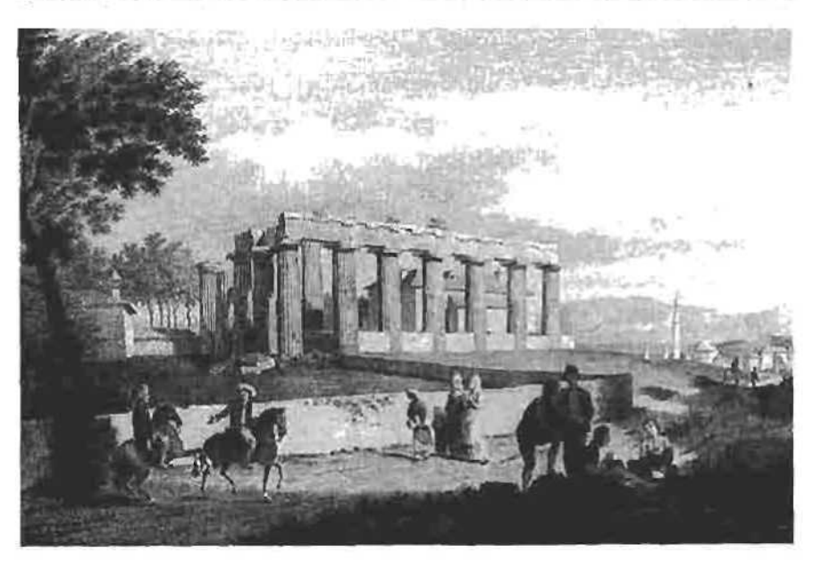
Figure 2.8 Stuart and Revett. The Antiquities of Athens, Volume 3. London 1787. Chapter 6, Plate 1. Korinth

Why this interest in sanctuaries and town centres? There is a simple answer. The Classical archaeologists who established this pattern in the discipline were guided above all by Pausanias and his detailed descriptions of the remains of the city centres and sanctuaries of Greece in Roman times. More generally the blueprint has been supplied by ancient literatures. Archaeology