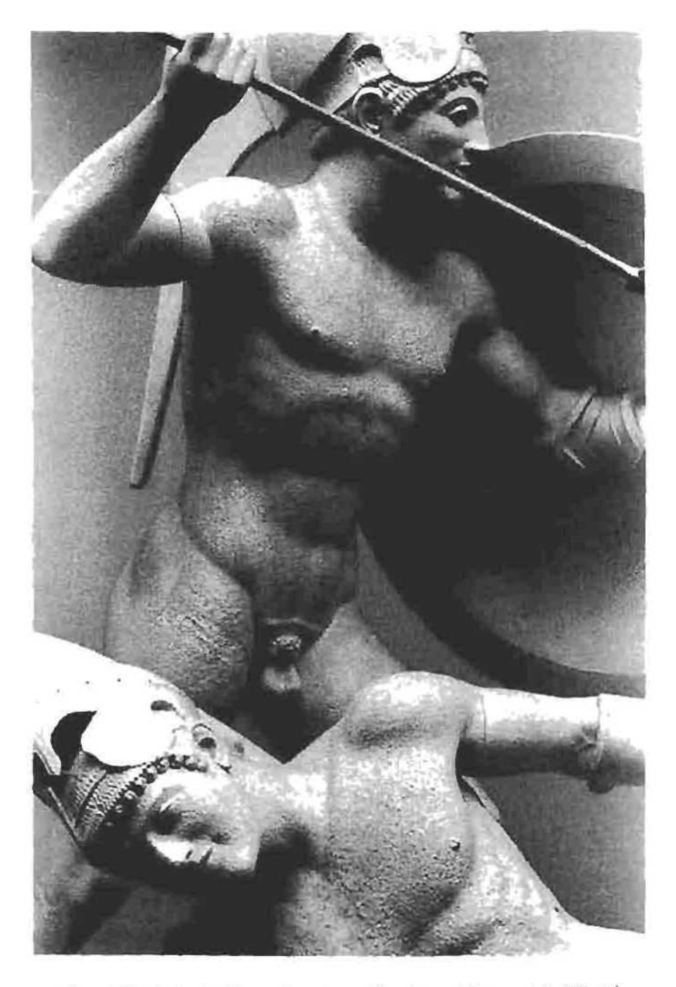
figure 2.5 Aegina. Pedimental sculpture. Von Klenze's Glyptotek, Munich