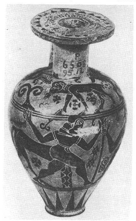
Figure 2.1a Protokorinthian aryballos in the Museum of Fine Arts, Boston.