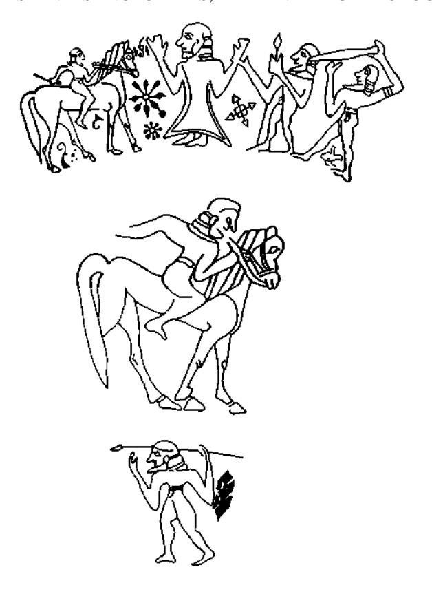
Figure 2.3 Figures from pots by the so-called 'Ajax painter'

There are two sorts of value here: one, the value accorded to individuality, the other being the symbolic value of the cultured individual artist. So it might be noted that, without the aesthetic connotations, such a search for individuality through the identification of idiosyncrasy was proposed by Hill and others in the volume The Individual in Prehistory published in 1977-The devaluation of the anonymous is a lament for the loss of the individual in the past, or at least their mark. Attribution is a search for the autonomous individual who has escaped the passing of time. Value is accorded to the individual as an ego signifying itself in the artwork. This is a distinctive and modern (bourgeois) conception of the individual; anthropologists and historians have recorded other conceptions of what it is to be an individual. The 'I<sup>1</sup> which is valued and pursued by the connoisseur is that which struggles for identity (in a power struggle), for permanence (the individual against time). The devaluation of some pots is the fear of anonymity, the ego dispersed, fragmented, lost (in the flow of time, in the mass of ordinary people, of undistinguished, 'coarse' pottery),