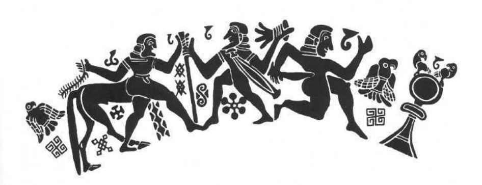
Figure 2.1b Detail of Figure 2.1a