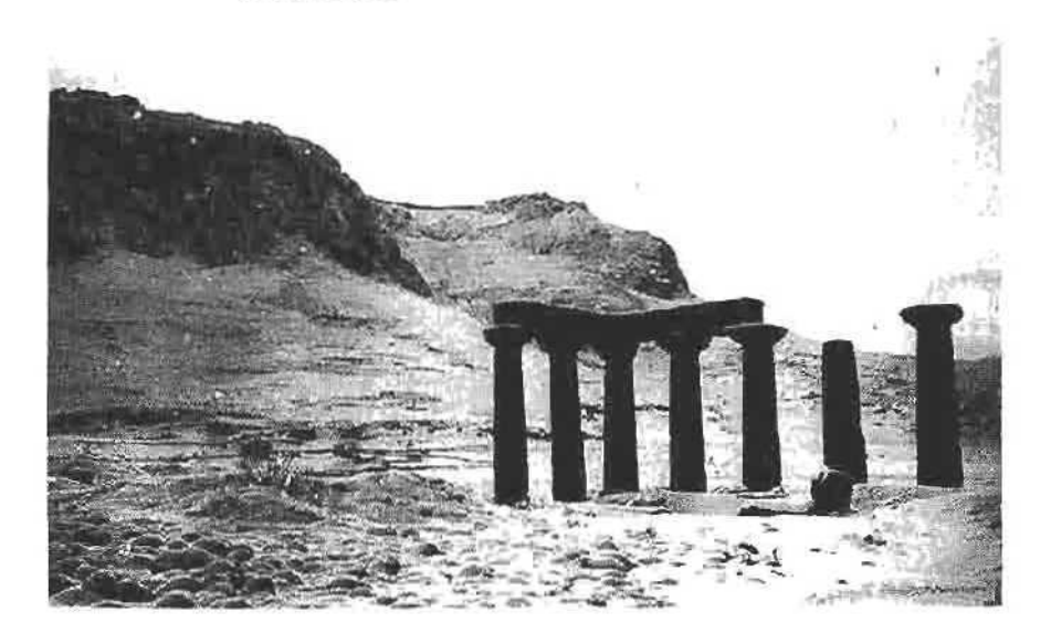
Figure 2.6 Korinth in the snow, before the excavations.

John D. Rockefeller allowed the Americans to win a concession to evict and dig. Between 1931 and 1939 another million came from Rockefeller. In total, 365 buildings were demolished, and 16 acres cleared of 250,000 tons of earth.