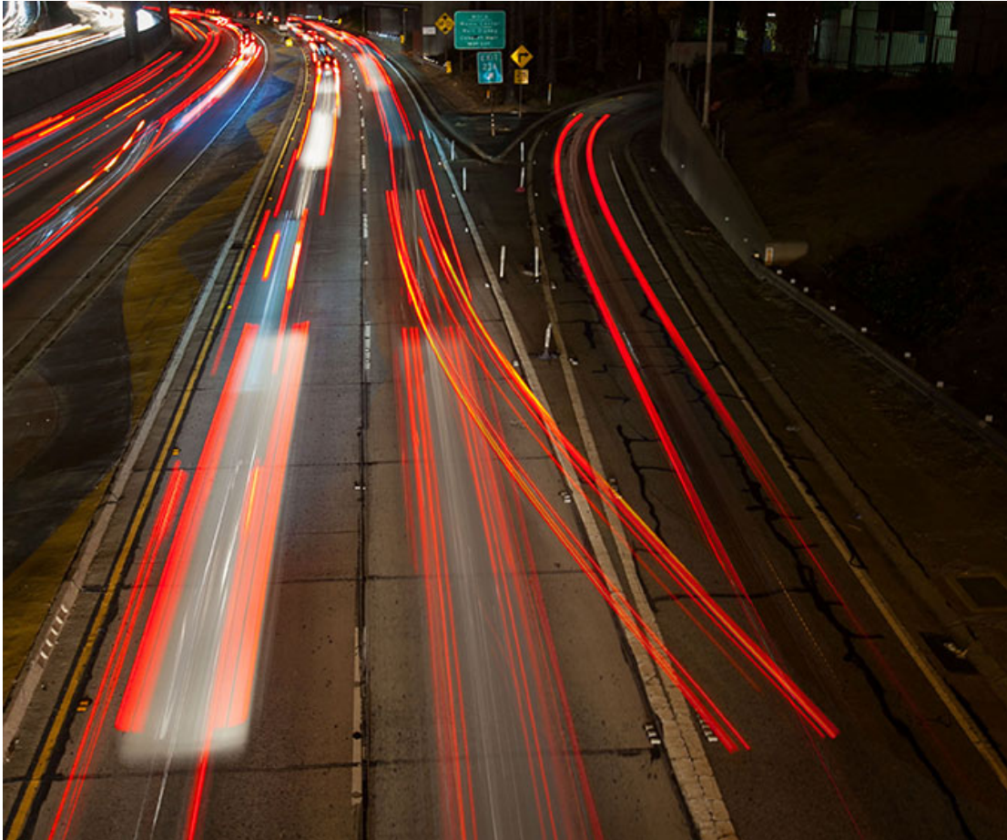
This four-second time-lapse photo of a Los Angeles freeway illustrates the complexities of decision-making, as one driver appears to have made a late change of mind while most drivers decided in advance whether to stay on the main road or take an exit ramp.

The research focused on the time the monkey spent deliberating, before the actual movement began. The monkeys were trained to sit motionless while two jittering targets were positioned on either side of a computer screen.